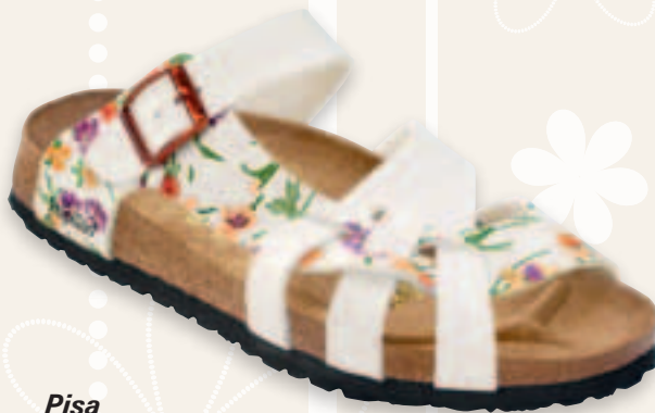
Pisa Vintage flower white / white

Birko-flor® · ☞ 3 17 74 1 · ☞ 3 17 74 3 size 36-42