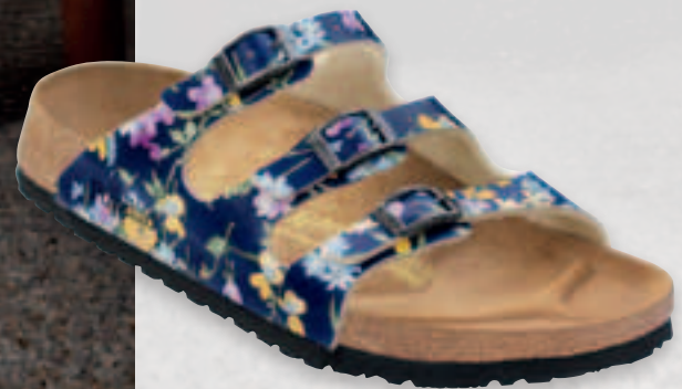
Florida Vintage flower blue