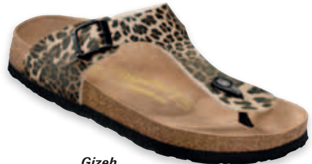
Gizeh Leopard classic dark brown