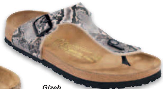
Gizeh Snake brown