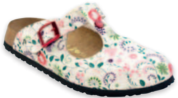
Frankfurt Flowerful white

The all-over design is available in blue and white.