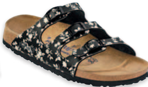
Florida Flower black white Soft Footbed

Birko-flor® · 👣 1 72 62 1 · 👣 1 72 62 3 size 36-42