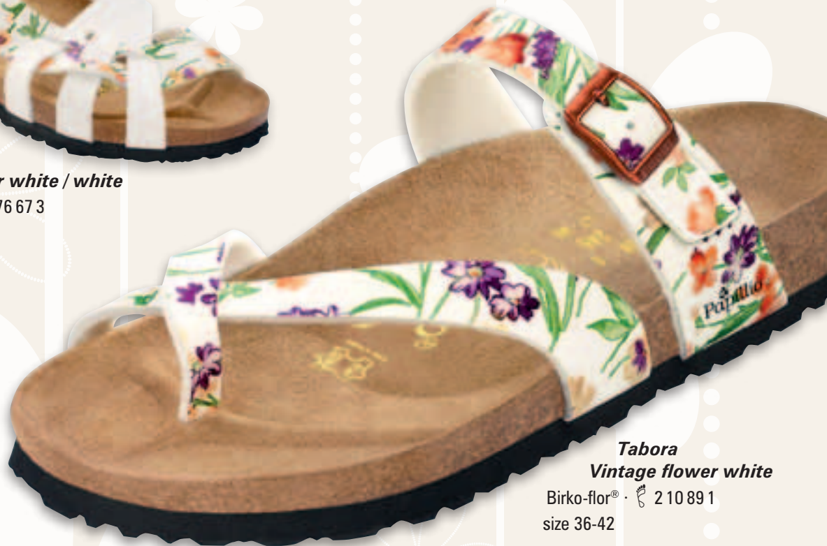
Tabora Vintage flower white