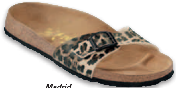
Madrid Leopard classic dark brown

On the next page you will find our new 'anaconda' design with the latest relief moulding which lends it a special 3D appearance!