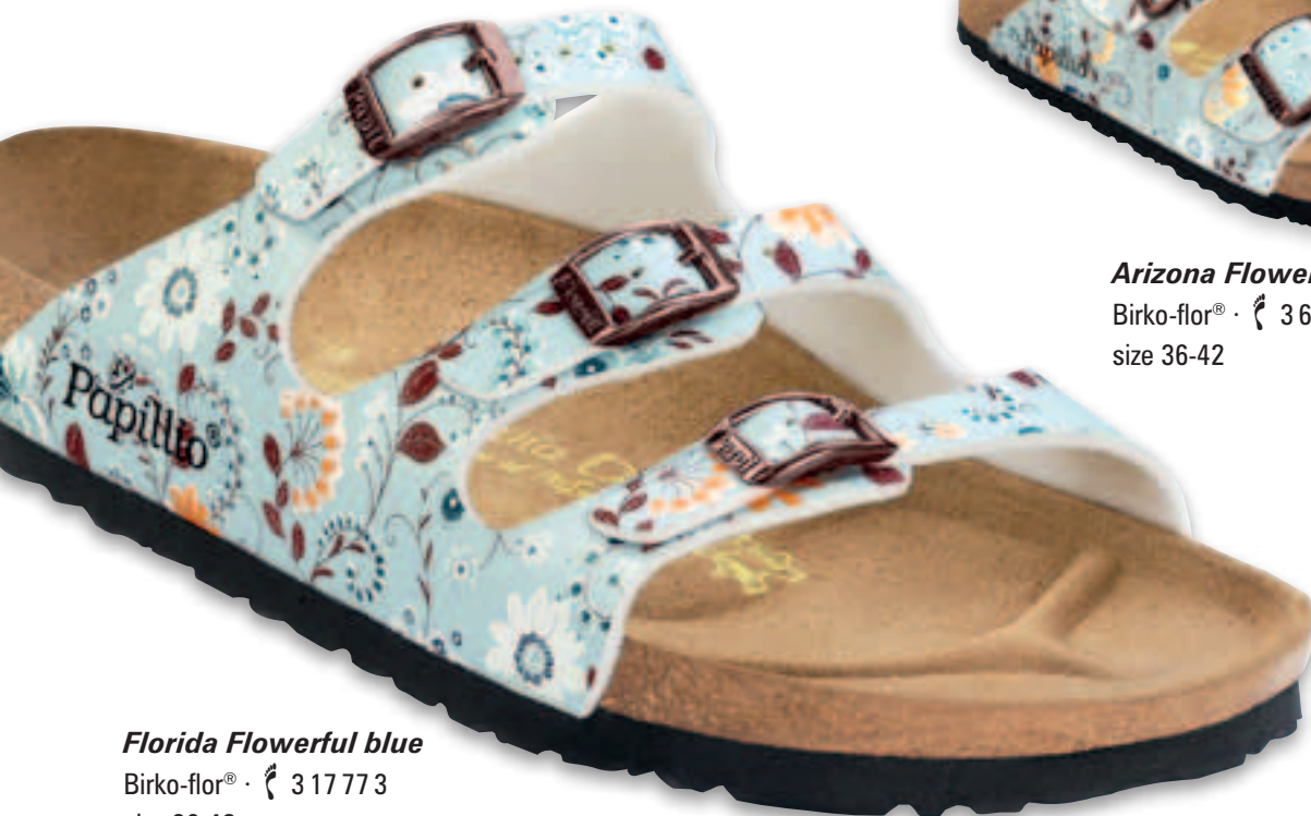
Florida Flowerful blue