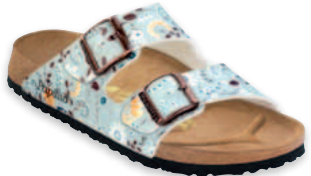
Arizona Flowerful blue