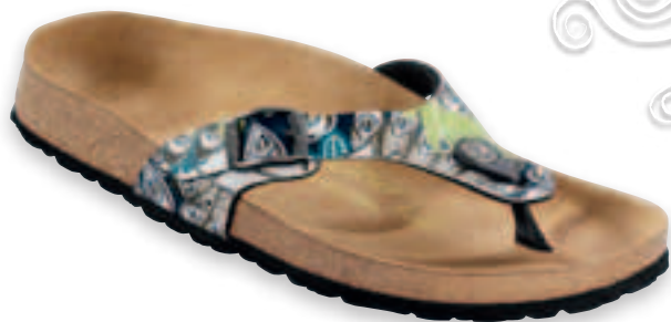
Turin Peacock blue Birko-flor® · 👤 2 36 61 1 size 36-42