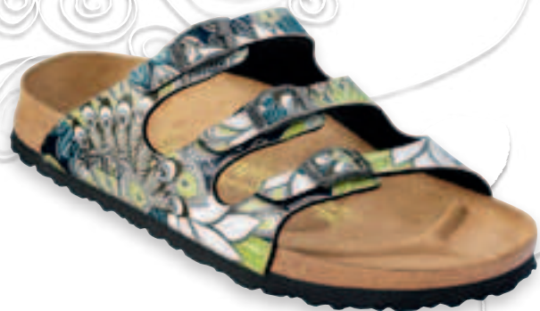
Florida Peacock blue Birko-flor® · 👤 3 17 58 3 size 36-42