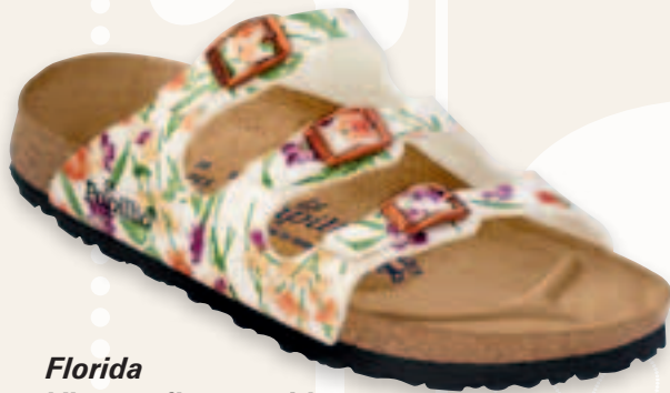
Florida Vintage flower white Soft Footbed

Birko-flor® · ☞ 3 17 74 1 · ☞ 3 17 74 3 size 36-42