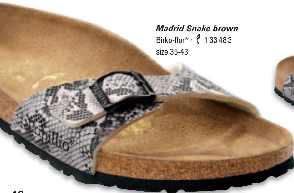
Madrid Snake brown