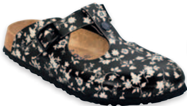
Frankfurt Flower black white Soft Footbed

Birko-flor® · 👣 1 72 62 1 · 👣 1 72 62 3 size 36-42