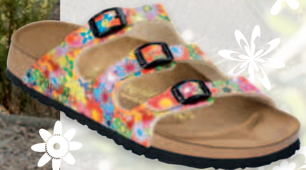
Florida Hippie flowers multi